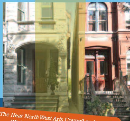
The Near North West Arts Council and Wicker Park Art Center, is housed in the former St. Paul's church on North Avenue.