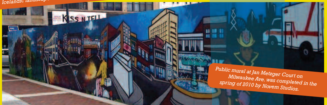
Public mural at Jan Metzger Court on Milwaukee Ave. was completed in the spring of 2010 by Novem Studios.