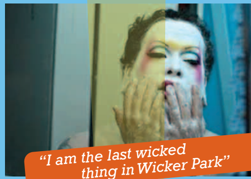
"I am the last wicked thing in Wicker Park"